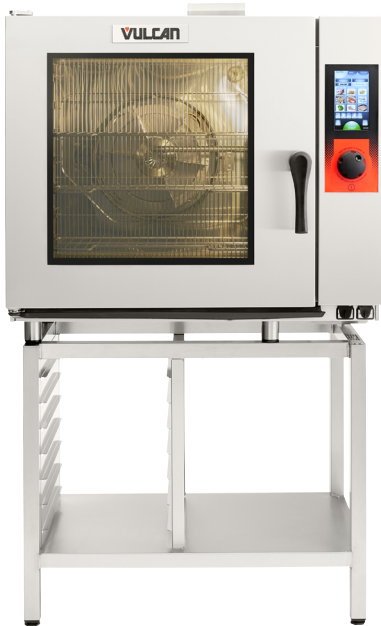
Model TCM61G Shown on optional stand